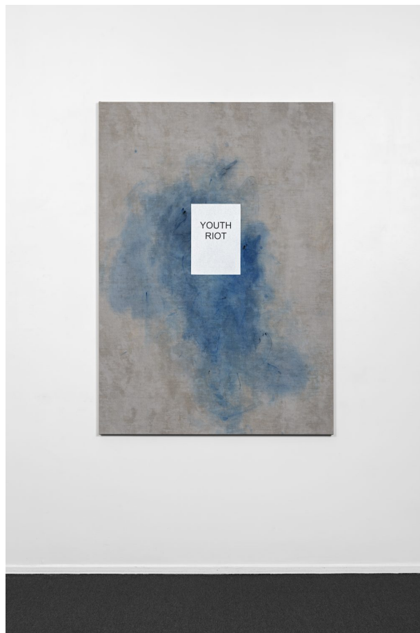
Youth Riot, 2017, acrylic and oil on linen canvas, 140 x 100 cm

'Eight Paintings' shows at Galleri K, Oslo until 23 April gallerik.com.