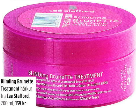
Blinding Brunette Treatment hårcrur fra Lee Stafford, 200 ml, 139 kr.

BLINDING BRUNETTE TREATMENT A regime for natural or coloured Brunette HAIR to restore your Brunette HAIR to Salon BEAUTIFUL SHINE This moisturising treat will big up those natural rich shimmering New HAIR looking and feeling LIKE UNTOUCHED VIRGIN HAIR (one with Morning Seed extract also known as Miracle Tree)