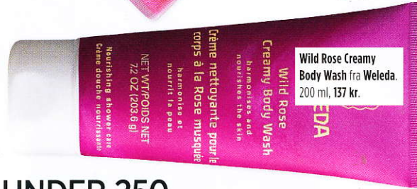
Wild Rose Creamy Body Wash fra Weleda. 200 ml, 137 kr.