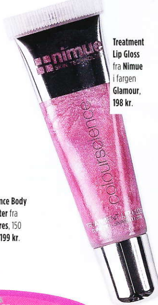
Treatment Lip Gloss fra Nimue i fargen Glamour, 198 kr.