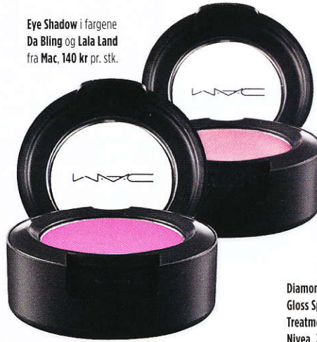
Eye Shadow i fargene Da Bling og Lala Land fra Mac, 140 kr pr. stk.