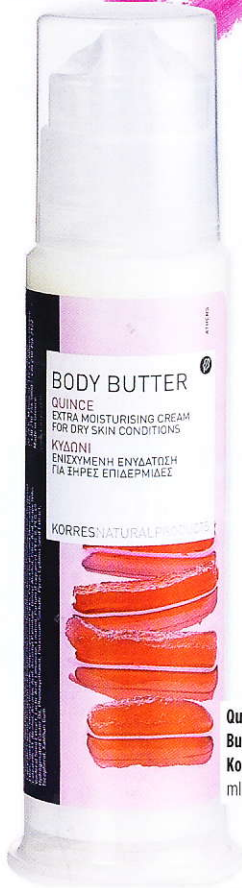
Quince Body Butter fra Korres, 150 ml, 199 kr.

Glitrende fuksiatoner spriter opp hverdagen. Og rosafargen får oss til å føle oss så herlig jentete!